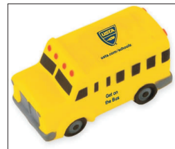
School Bus Stress Toy sold in packs of 12 only COL-STSB $24.99