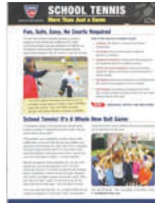
Advertorial (package of 50) COL-STB $10.00