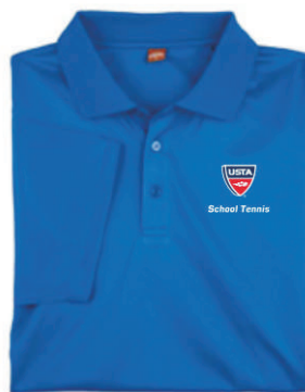
Lightweight Performance Polo Embroidered with USTA School Tennis. Available in royal blue, navy, red or black. Men's MLP Sizes: XS-5XL (add $4.00 for sizes above XL) Ladies LLP Sizes: S-2XL (add $4.00 for sizes above XL) $24.00 (price good until 12/31/11)