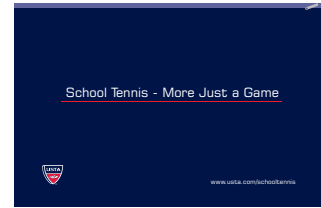
Zip Pouch COL-SDZB $3.75