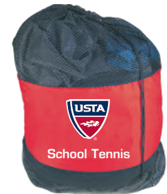
Equipment/Utility Bag COL-SEUB $7.95