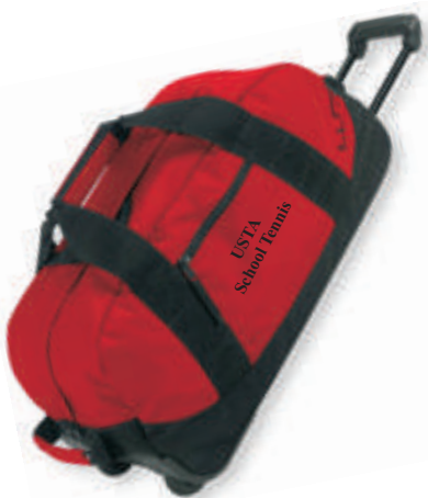
Rolling Racquet Bag SCH-RB (36") $89.00