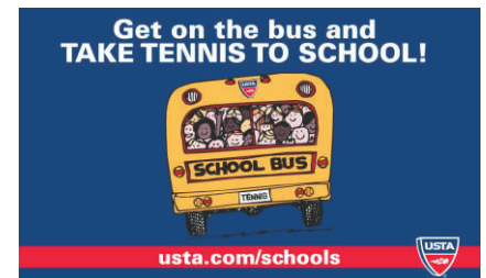
Take Tennis to School Banner SCH-BANNER (3' x 5') $30.00

NetKnacks 800-374-6153 tennisawards.com sales@tennisawards.com