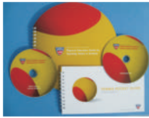
Curriculum Kit COL-SPEG $35.00