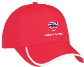
Red Moisture Wicking Cap SCH-CP $9.50