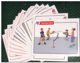
Set of Laminated Station Signs COL-STSS $15.00