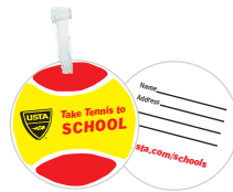
3 1/2" Bag Tag SCH-LTG $3.50